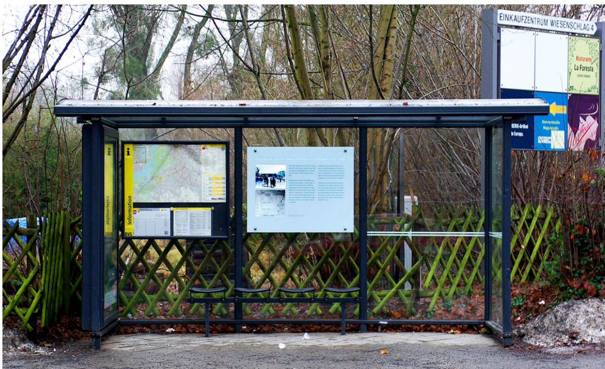
Buswartehalle / Bus Shelter Berlin-Zehlendorf - Potsdamer Chaussee 87